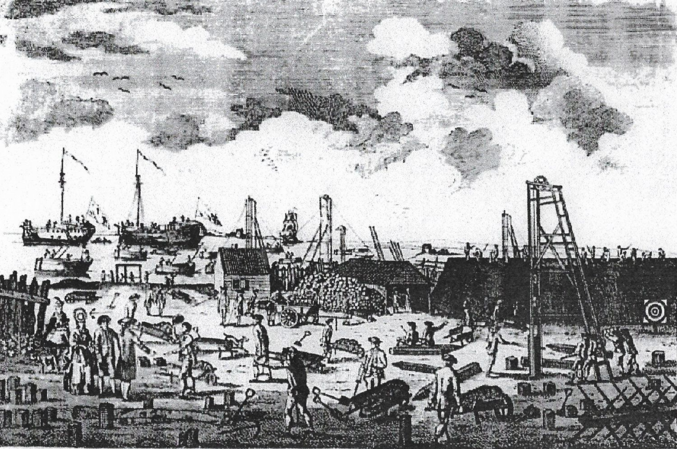
Prison hulks at Woolwich showing convicts at work on the embankment