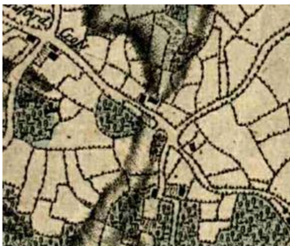
Mount Pleasant Farm later to be Thorn Lodge From Yeakel and Gardener Map 1778-83

Known as Thorn Farm by 1865 but farmstead relocated c1870 when the site is re-used for The Thorne, a gentleman's residence with ancillary coach-house and stables. The farmhouse was also re-located to a new detached further west. See Property History P5/XXX for later details of relocated farm and P5/171 for The Thorne.