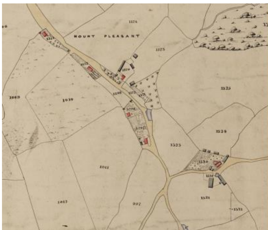
Portion of Tithe map 1839 showing the Mount Pleasant area. Mount Pleasant farmstead plots 1170, 1171 & 1172, north-east of road, farmhouse in red, outbuildings black.

Total approx. 141acres. It will be seen that arable agriculture dominated the farm at that time. In the same ownership and tenancy was the adjoining property Shortwood Farm. This comprised of 14 plots, total 77a.3r.39p., again mostly arable but with three fields of pasture and two of woodland.